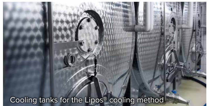
Cooling tanks for the Lipos® cooling method