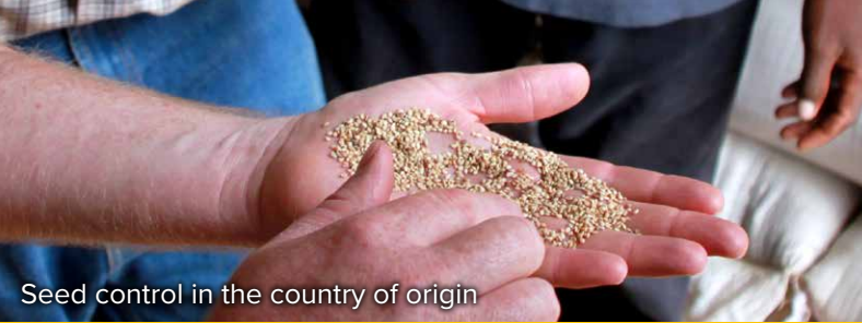
Seed control in the country of origin