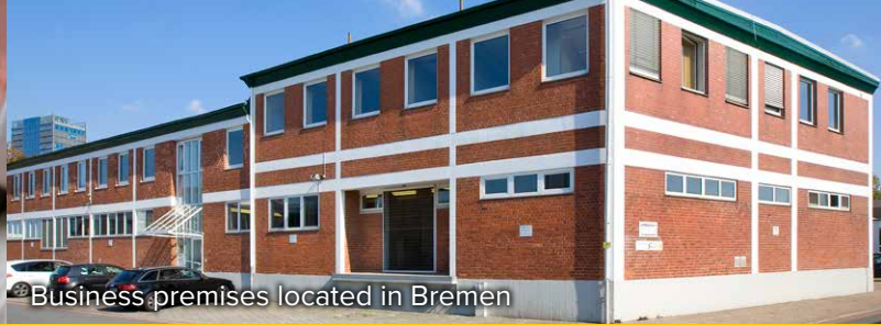
Business premises located in Bremen